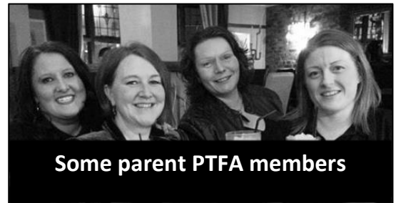
Some parent PTFA members

We always welcome new volunteers!! Even if you can't attend meetings or every event, any support you can provide from PAT testing equipment, being a DJ at a disco - to simply wrapping lucky dip prizes or washing tombola sheets, all help is appreciated. We also have some informal meetings at different venues, as well as social events for PTFA parent / carer helpers too! Please feel free to approach us within the school playground or via the school office and join in with the PTFA. ☺